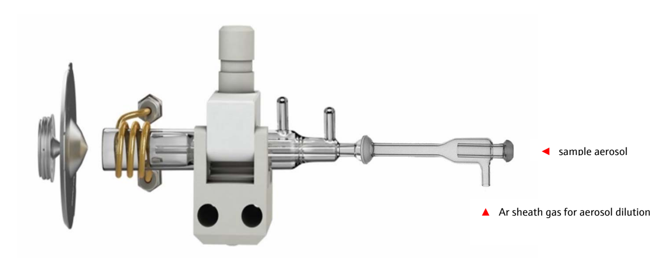
Figure 1: Standard aerosol dilution setup on the Analytik Jena PlasmaQuant® MS ICP-MS

The hardware setup for aerosol dilution is straightforward as shown in figure 1. The sheath gas port is offered as standard on the Analytik Jena PlasmaQuant® MS ICP-MS.