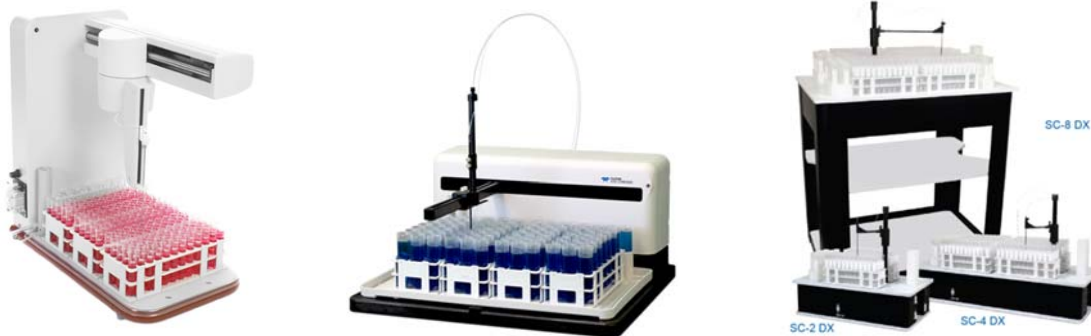
General purpose range of autosamplers from Analytik Jena, Cetac Technologies and Elemental Scientific

Autosampler enclosures are available for all models and are recommended for minimizing sample contamination. Purged systems are preferred as they create a positive pressure within the autosampler compartment, thereby eliminating dust particles from the local environment.