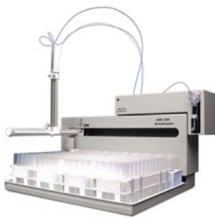
The Cetac Technologies ADX-500 Online Autodilution Accessory with ASX-520 autosampler

Online dilution systems are designed for automatic dilution when measured elements exceed the calibration concentration range during the analysis of a sample. When overrange concentrations are detected, the sample is automatically diluted and re-sampled until all overrange elements fall within the valid calibration range. The results are then automatically updated by the instrument controlling software to account for the dilution factor and the next sample is analyzed. This frees valuable personnel from time-consuming, manual sample handling and eliminates the need for additional work upon completion of the analysis.