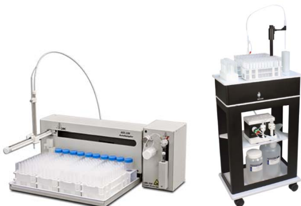
The Cetac Technologies 'SDS-550' and Elemental Scientific 'prepFAST', Offline Sample Dilution Systems

Offline dilution systems are programmable dilution systems that automate the preparation of calibration standards and samples prior to analysis by ICP-MS. Using a purpose-built software platform, method programs are developed for preparing sample batches, instructing the sampler and auto-dilution system on the volume of sample to be collected, the location of the awaiting dilution tube, which reagents to mix and the final dilution volume required for each sample. The preparation of calibration standards from bulk standards and the addition of internal standard to each solution are also possible. Preparation work is typically done offline with a dedicated PC and without being directly connected to the ICP-MS. Labor intensive sample preparation is greatly reduced for routine applications without sacrificing accuracy and precision, requiring only the transfer of prepared solution racks to the ICP-MS autosampler for analysis.