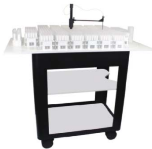
High capacity autosamplers from Cetac Technologies and Elemental Scientific