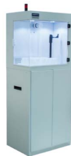
Ultra-clean autosamplers from Cetac Technologies and Elemental Scientific