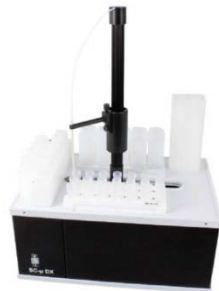
Low volume autosamplers from Cetac Technologies and Elemental Scientific