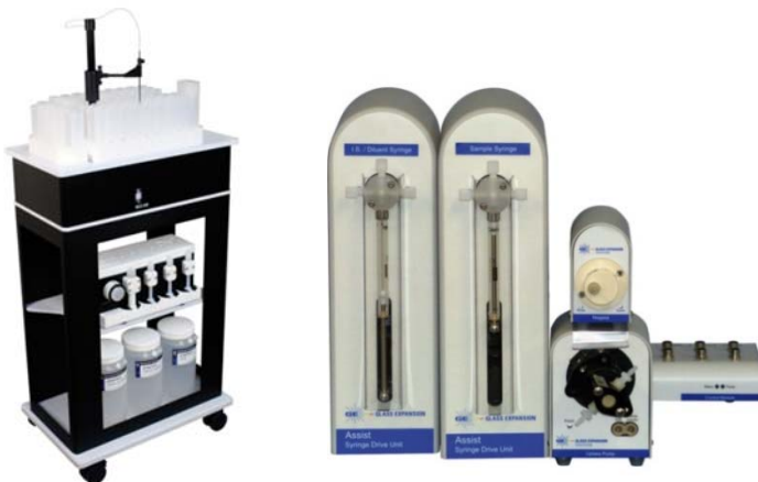
Elemental Scientific 'prepFAST' and Glass Expansion 'Assist CM' inline dilution systems

Inline dilution systems remove the need for manual dilutions by laboratory personnel for sample types such as seawater, brine solutions, effluents, soils and sediments, metals and mining samples that often exceed the TDS limit of ICP-MS. Real-time, in-line dilution also means sample analysis times are constant, independent of dilution factor.